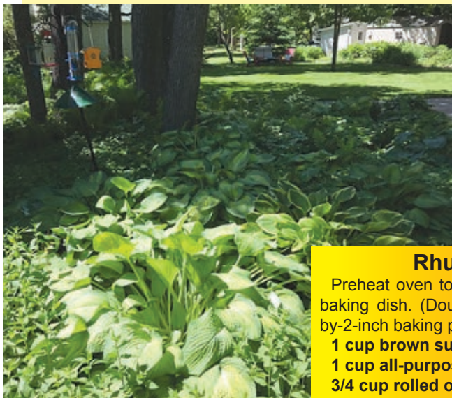
The Rhubarb And All The Gardens Are Really Blooming Nicely.