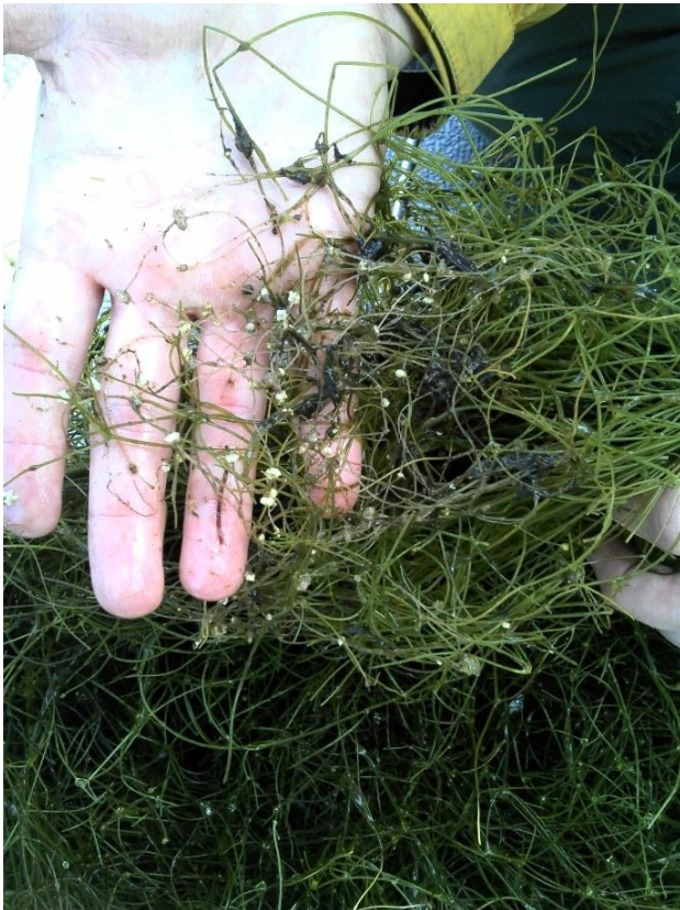
Starry stonewort pulled from Minnesota's Lake Koronis, August 2015

Starry stonewort is a grass-like form of algae that are not native to North America. The plant was first confirmed in Minnesota in Lake Koronis in late August of 2015. Plant fragments were probably brought into the state on a trailered watercraft from infested waters in another state.